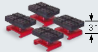
4 low adapters included