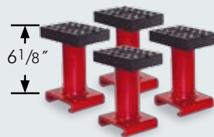
4 high adapters included