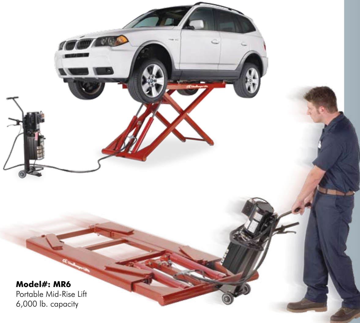
Model#: MR6 Portable Mid-Rise Lift 6,000 lb. capacity