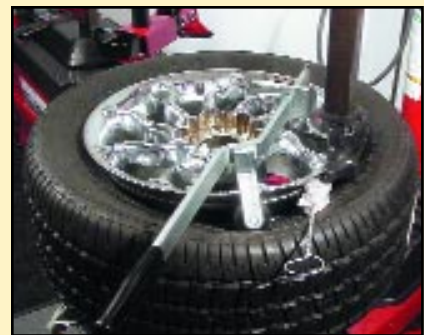
Manual bead roller assists in lubrication and mounting of top bead.

Manual Bead Roller included in Coats Robo-Arm™ Kit or can be purchased separately (Part # 184052)