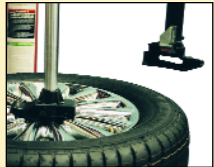
Coats Robo-Arm™ pushes wheel down on stiff sidewall tires to assist in wheel clamping.