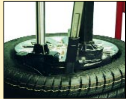
Presses tire sidewall down to help insert lift tool.

HENNESSY INDUSTRIES, INC., MANUFACTURER OF AMMCO®, COATS® AND BADA® AUTOMOBILE SERVICE EQUIPMENT AND TOOLS