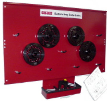
With 11 Hook Storage Panel