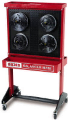
With Balancer Mate