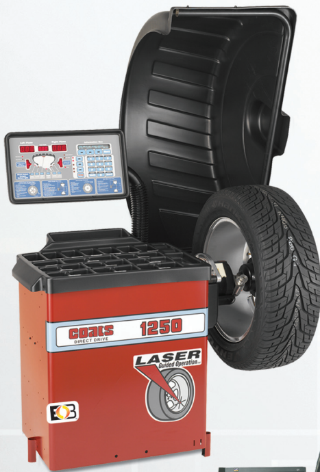
COATS 1250 Balancer

EB is a standard feature on all XR Balancers and an option on the COATS 1250 Balancer.