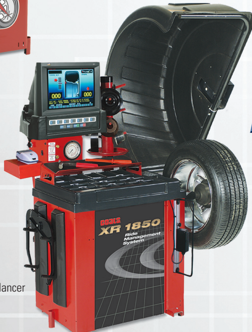
COATS XR 1850 Balancer