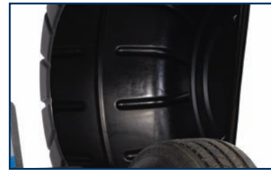
Auto Start Hood